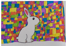
By Akshara Pinnamaraju Grade 5